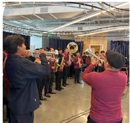
Maqueos Music, A Place Called Home's youth ensemble.