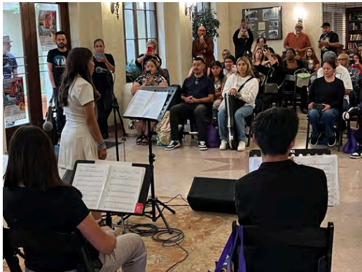
YMF's Los South Central Players at the Dunbar.

YMF was honored to again receive an invitation to participate in the 29th Annual Central Avenue Jazz Festival, a nationally renowned celebration of jazz and culture in Historic South Central. YMF's Los South Central Players performed at the legendary Dunbar Hotel just five blocks south of the YMF Center. In a special surprise appearance, LA Mayor Karen Bass, accompanied CD9 Councilperson Curren D. Price, Jr. offered words of encouragement to our students and shared her belief in the power of music to transform individuals, communities and civil society as a whole.