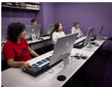
Creative Career Pathways class.