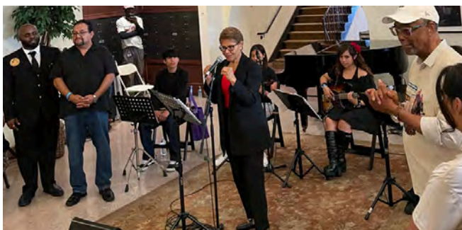
LA Mayor Karen Bass speaking at the performance.

YMF was honored to again receive an invitation to participate in the 29th Annual Central Avenue Jazz Festival, a nationally renowned celebration of jazz and culture in Historic South Central. YMF's Los South Central Players performed at the legendary Dunbar Hotel just five blocks south of the YMF Center. In a special surprise appearance, LA Mayor Karen Bass, accompanied CD9 Councilperson Curren D. Price, Jr. offered words of encouragement to our students and shared her belief in the power of music to transform individuals, communities and civil society as a whole.