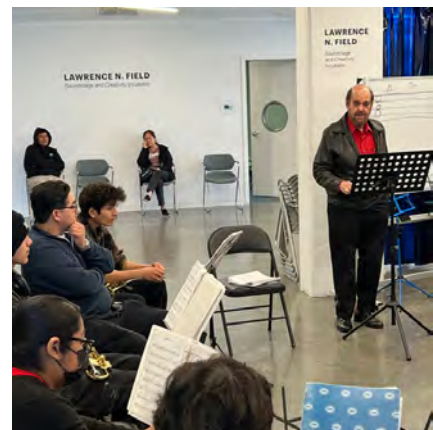
Lawrence N. Field Soundstage and Creativity Incubator