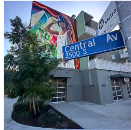
3-storey mural of Florence Mills at CMCT

The YMF Center for Music and Creative Technologies features a state-of-the-art media arts lab, audio/video recording control room, five classrooms, and a large program/performance space designed for maximum flexibility. The Center offers tuition-free music and media arts after-school and weekend classes in instrumental music, music fundamentals, music technology and production. The Center has also enabled us to significantly expand our Creative Career Pathways programs for reentry and at-risk youth, and workforce development programs in media arts.