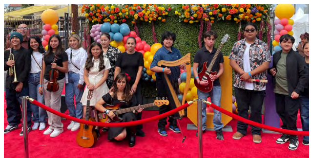
Los South Central Players