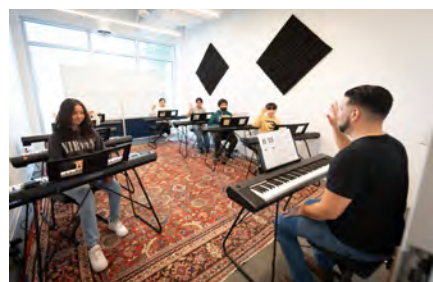
Ella Fitzgerald Keyboard Lab